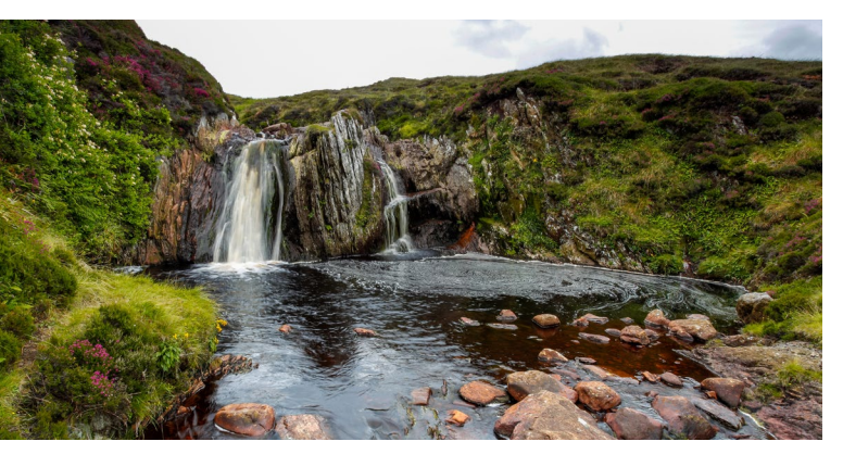
↑ Burn of Lunklet