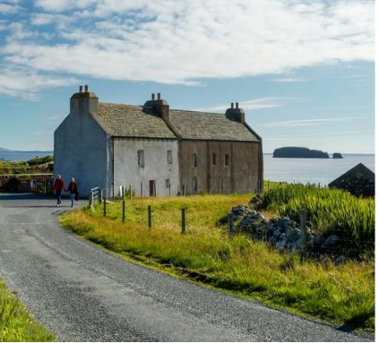
↑ Tangwick Haa Museum