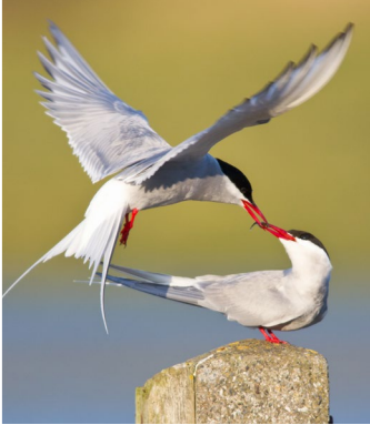
↑ Arctic Tern