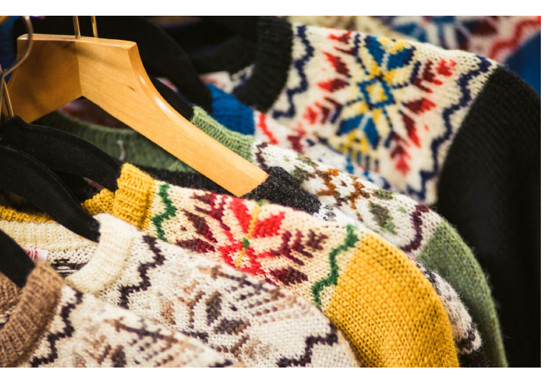
↑ Fair Isle is famous for its knitwear Shetland Amenity Trust