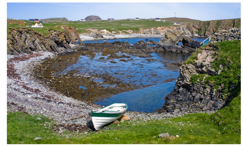
↑ Kirki Geo Beach, South Harbour

The crofting year has a task for every season with most islanders combining several part-time jobs with their croft work. As well as the ferry, school and other public service jobs, income also comes from knitting, yarn and other textiles, wildlife tourism, a local building firm and the shop and post office.